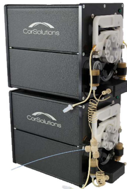
Two PeriWave pumps connected via a tee fitting allow for accurate delivery of two fluid streams.

Fluid delivery using a syringe pump is undesirable. If backpressure is increased, the pulsation is reduced, but then the response time increases.